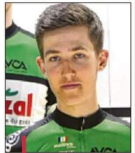
Le jeune Anglais rêve de passer pro d'ici trois ans.

Prendre le temps, c'est l'intégrer petit à petit dans les grandes courses élites. Dimanche dernier, Harrison a