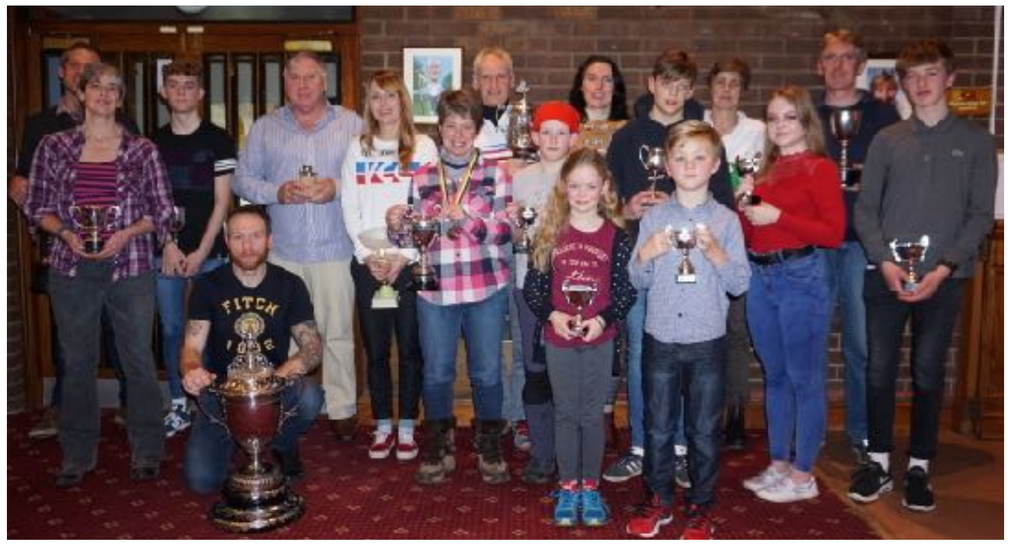
2017 Club Award Winners